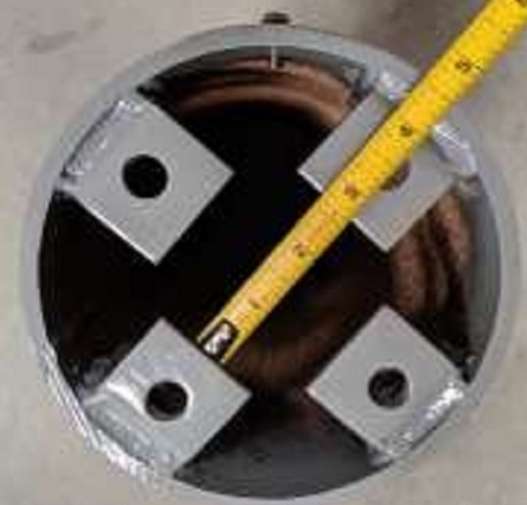
The #8 gauge 3 conductor wiring should be in a 2" - 2-1/2" conduit in the center of the pad and extend 6" above the pad.

Install on a concrete 12" square by 4-6 inch thick pad.